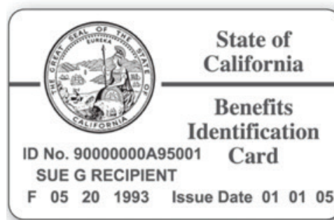
Your Medi-Cal Card